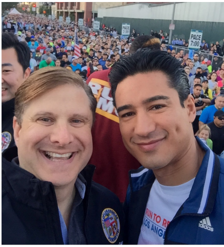
With Mario Lopez at the Run to Remember race.